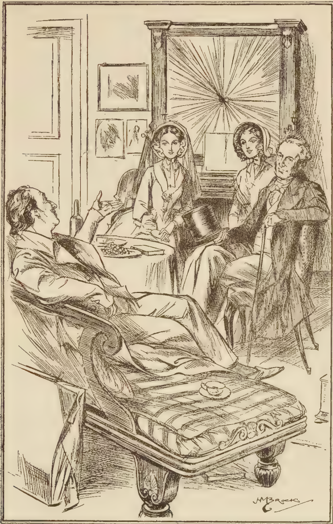
Mr. Skimpole at Home